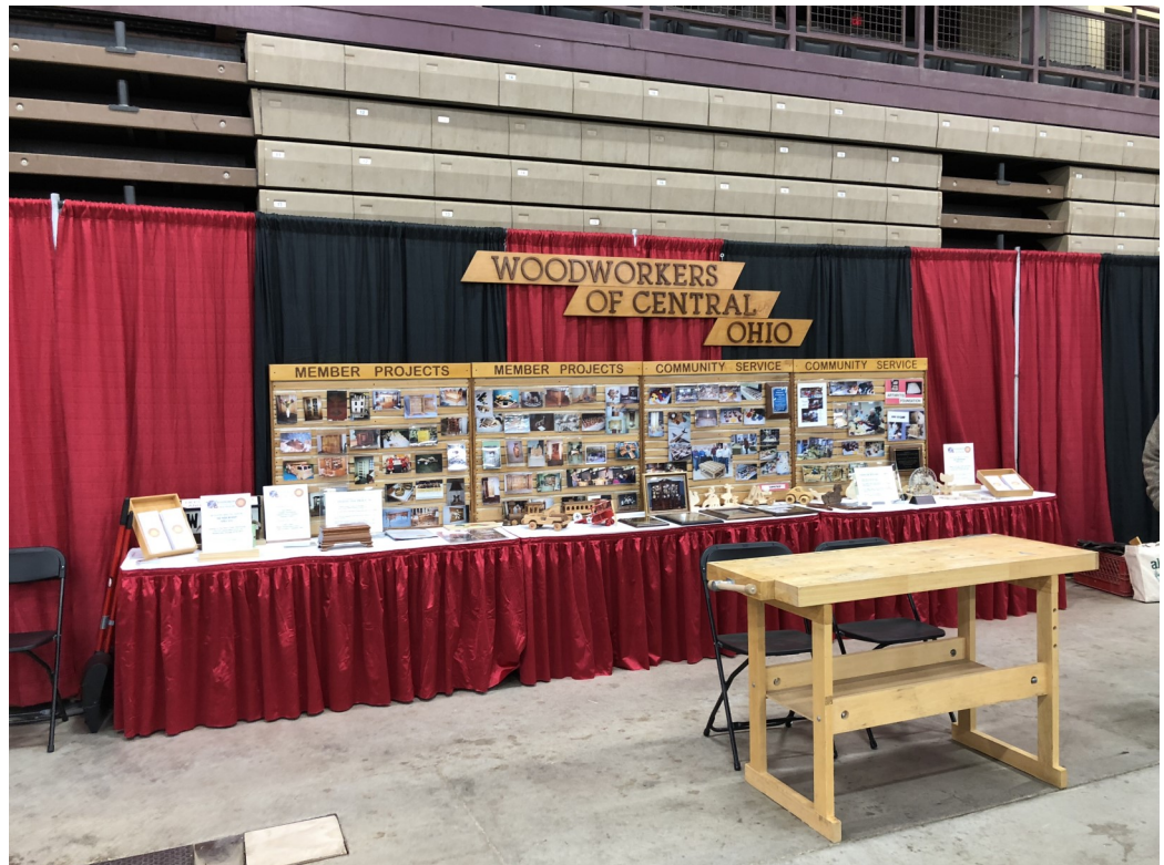
Picture Above: Our WOCO Woodworkers of Central Ohio booth at the Woodworking Show—Columbus.

We will have volunteers at this show explaining the photos of several club events, wood projects, awards, and inviting visitors to become WOCO members. There will be samples of member toys and other projects. We will have a drill press station where we will show a finished marble game and allow youth and adults to use a drill press to create a portion of a marble game. After using the drill press, we will give the visitor a completed marble game. Some of our members will be demonstrating tools and techniques each of this three day event.